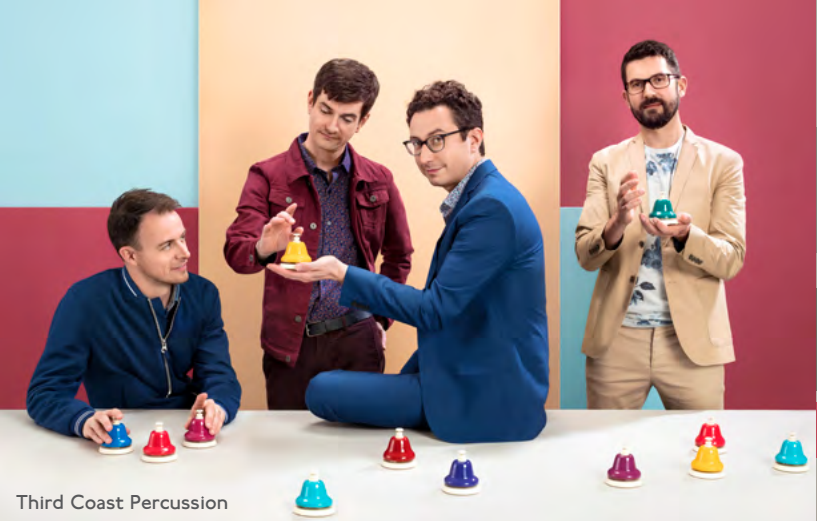
Third Coast Percussion