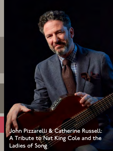
John Pizzarelli & Catherine Russell: A Tribute to Nat King Cole and the Ladies of Song