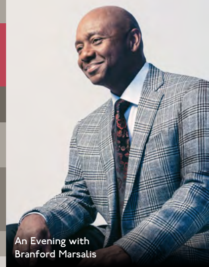
An Evening with Branford Marsalis