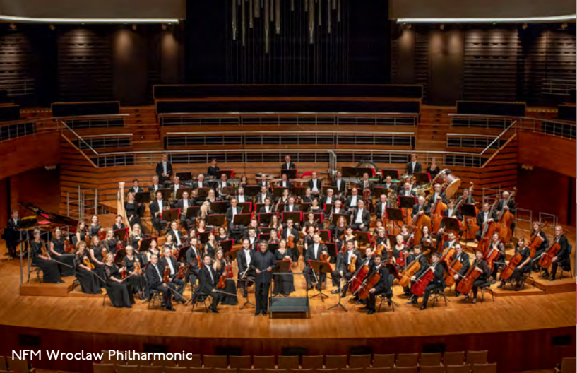
NFM Wrocław Philharmonic