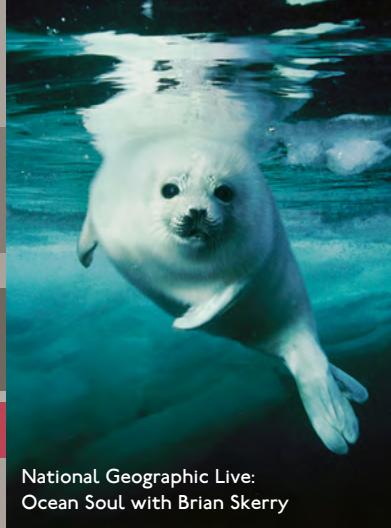
National Geographic Live: Ocean Soul with Brian Skerry